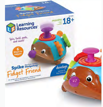
Spike the Fine Motor Hedgehog

Spike merges tactile exploration with innovative technology, actively engaging children in the learning process. Real Play, Real Learning, Real Fun!