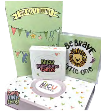
NICU Milestones Cards

Here are three easy and affordable products every NICU parent deserves to make the NICU experience easier, calmer, and more joyful. Includes: NICU Journey Journal, Milestone Cards, Art Cards, Keepsake Box.