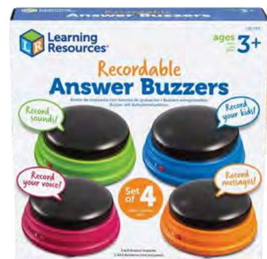
Watcha Gonna Say?

Come up with your own fun buzzer sounds! Record silly messages, words, sounds, or music—the possibilities are endless! Record up to 7 seconds per buzzer. Just tap, record, tap, and listen!!