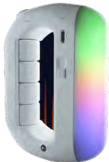
Dance When You Want To!

Move, Mix and Create with RUKUSfx, a hand-held motion-controlled music mixer! With 4 simple moves— PUNCH, SWIPE, TWIST, and FLICK – creators can loop, mix, and remix customized music tracks sure to take performances to the next level.