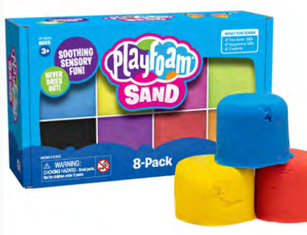
Life's a Beach

Who doesn't love making sand castles on the beach? And who hates cleaning up the sand? With this magic, moldable sensory sand, kids of all ages will enjoy creating masterpieces without the mess.