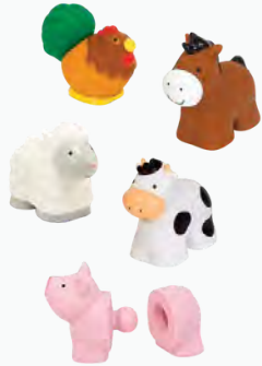
Farm Fresh Animal Blocks

Five adorable animals pop together, pull apart, and mix up in all kinds of exciting ways. Encourages sensory development, tactile strength, emotional connection