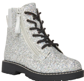
Steve Madden Adaptive